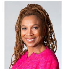
(Crenshaw, Columbia Law, retrieved from https://www.law.columbia.edu/faculty/Kimberle-w-crenshaw )