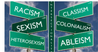
( https://www.newtactics.org/blog/intersectionality-tool-realizing-human-rights )