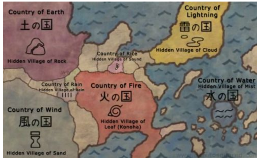
World map of Naruto