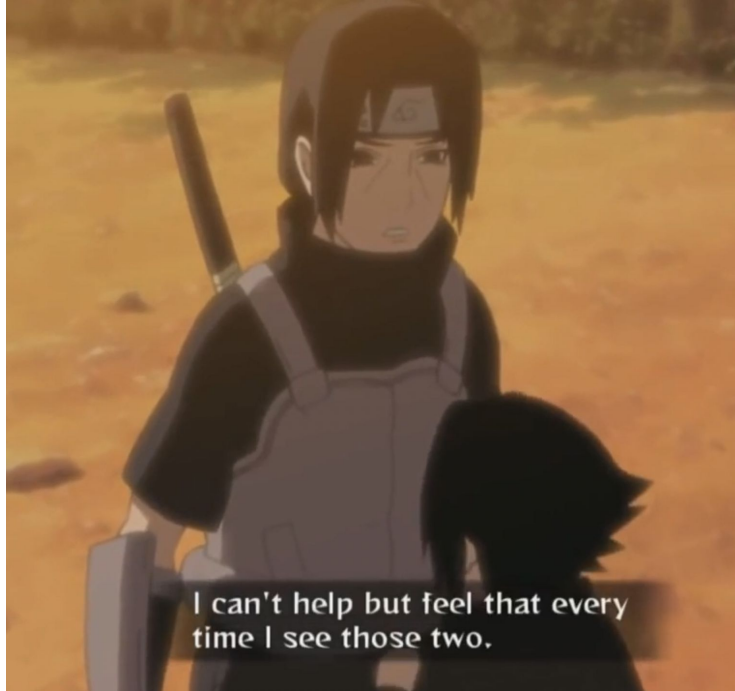
Itachi and his little brother Sasuke

“It’s great to be a family. I can’t help but feel that, every time I see those two.