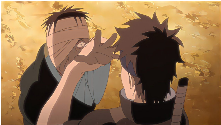
Danzo attacking Shisui (image credited Naruto Shippuden E358)

Shisui was about to use his Kotoamatsukami on his clan (to stop the coup), but Danzo came and stole one of his eyes.