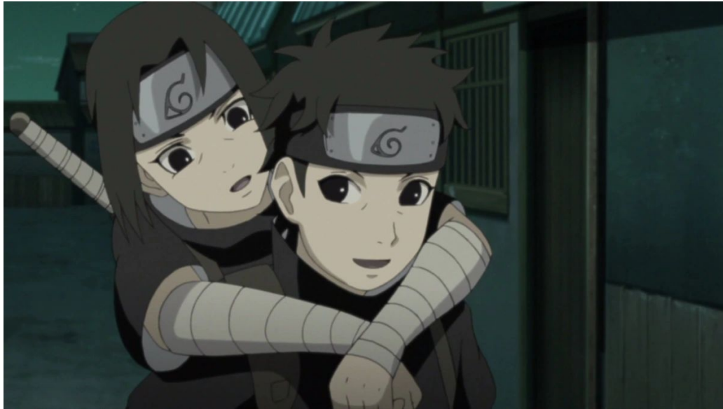
Itachi and Shisui